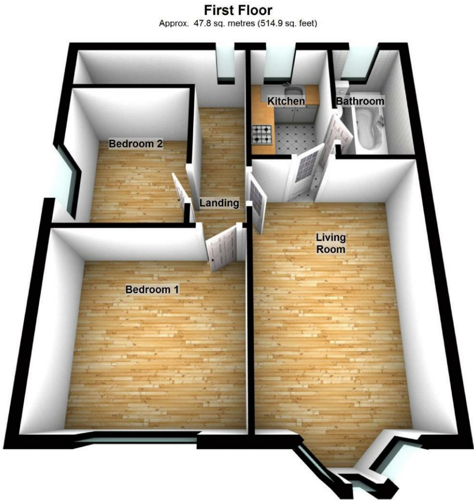
Total area: approx. 47.8 sq. metres (514.9 sq. feet)

These particulars, whilst believed to be accurate are set out as a general outline only for guidance and do not constitute any part of an offer or contract. Intending purchasers should not rely on them as statements of representation of fact, but must satisfy themselves by inspection or otherwise as to their accuracy. No person in this firms employment has the authority to make or give any representation or warranty in respect of the property.